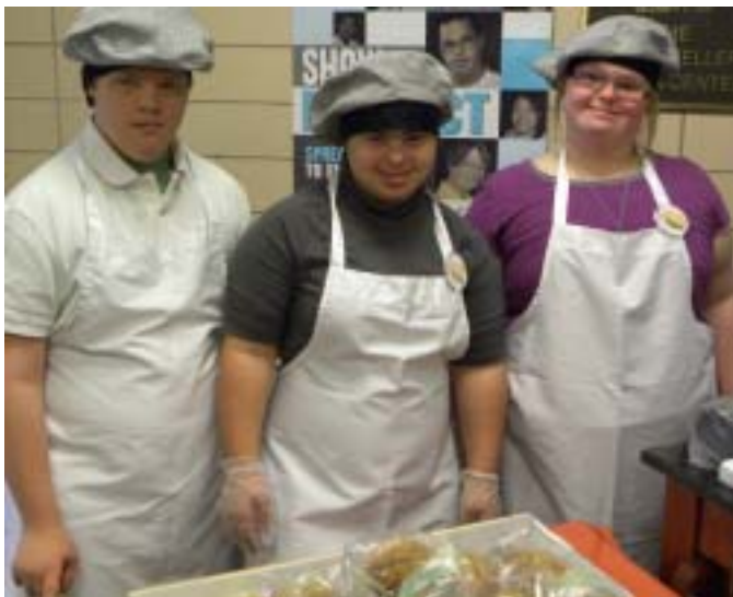
Students ready to serve at the Sunrise Café.