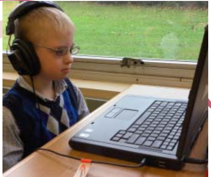
Students in the library have access to laptops and RAZ Kids, a literacy program which allows them to access books online at their assessed reading level, which they can read themselves or the program will read to them.