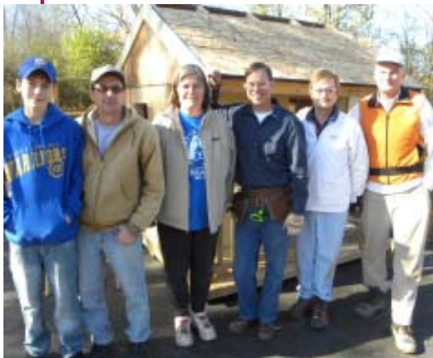
Holy Childhood has a new playhouse, donated and built by the Koinonia Mission Company (KMC) as part of Flower City Habitat For Humanity's Women Build 2011. The playhouse was a practice build before the group attempted a full-size house in Rochester this past year. Our students will make sure it is appreciated for all the hard work that went into it!

Thanks to UPS! Members of the Henrietta and Fairport management teams took care of some fall cleaning, inventory and yard work for us in October as part of their Neighbor to Neighbor program.